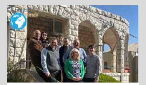
A bridge of hope? The Baptist witness in Israel and Palestine - reflections to help fuel our prayers