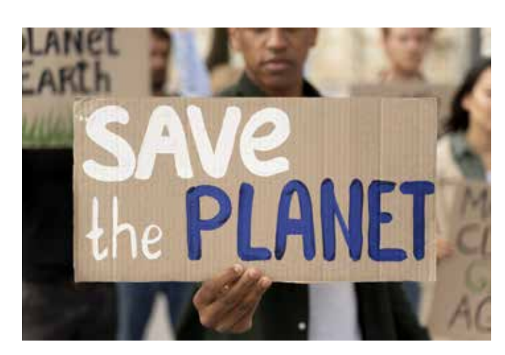
WONDERFUL YOUTH: A 'PROPHETIC VOICE'